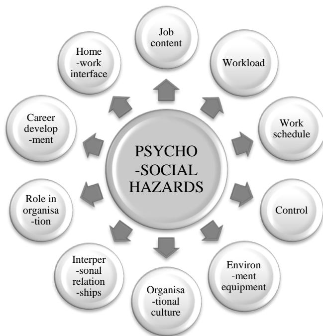
Figure 1. Psychosocial hazards related to work (Sadłowska-Wrzesińska, 2014).

Currently, Poland does not have legislation which would introduce an obligation on the prevention of stress in the workplace, but in the guidelines for the National Strategy for Health Care of Workers (Labor Protection Council, 2012) tasks involving the development of regulations conducive to mental health promotion and monitoring of psychosocial factors posing the risk of mental health problems in the workplace were included (Rantanen and Kim, 2012).