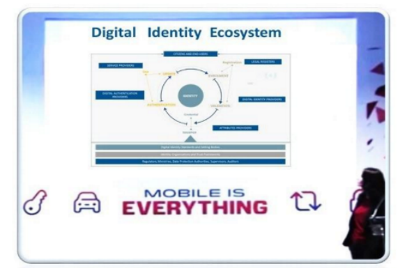
Fig. 1. The global momentum to endow each individual with a digital identity may be an appropriate vehicle to embed individual personal security agents (IPSA).

Starting with individual medical records<sup>[14]</sup> and continuing<sup>[15]</sup> to "DIE" promoted<sup>[16]</sup> by the World Bank and advocated<sup>[17]</sup> by GSMA, we must now deliver security and privacy at the level of individual citizens with a digital footprint based on their digital identity. The medium of delivery for IPSA is linked to OPSA because humans need a medium to interact with the cyber-world. That medium is provided by objects and may use various forms of IoT, by design, for industrial or consumer applications.