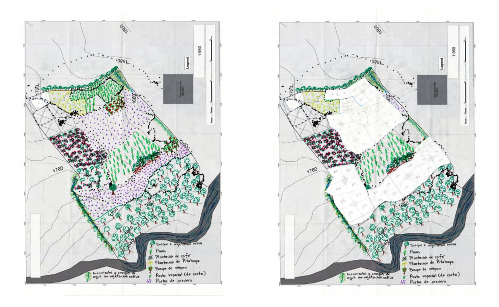
Figure 1. Social cartography of Florida Family.

The interviews and observations conducted on the farm regarding the implementation of the agroecological practices aimed to identify both human and non-human actors involved, as well as to document the phases of reflection-action-reflection of the innovation process towards agroecology. Social cartography began in 2019 with the design and implementation of agroecology on each farm, involving discussions among family members. By 2020, a farm redesign process occurred, resulting in the creation of the 'dream farm,' which included additional production lines that enhanced the farm's multifunctionality compared to the initial map.